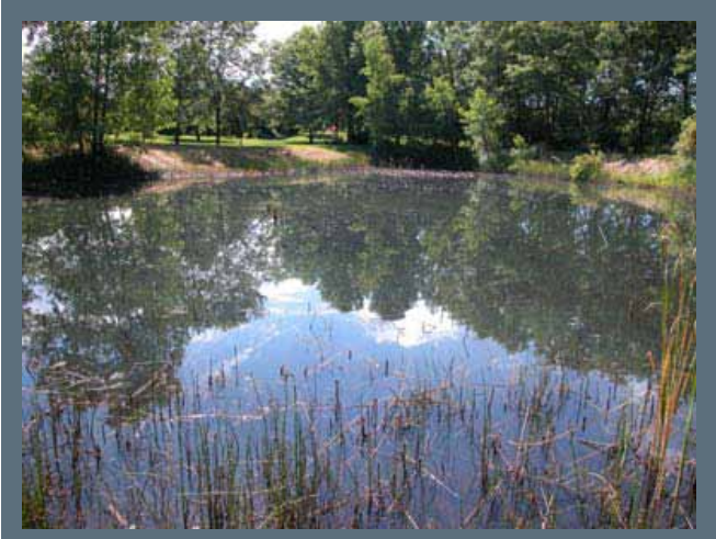
7 days after treatment with Clipper