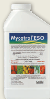
Sizes: 1pt, and 1gal.

Mycotrol's mode of action is unlike any conventional insecticide. The applied spores infect directly through the outside of the insect's cuticle (the skin). Spores adhering to the host will germinate and produce enzymes that attack and dissolve the cuticle, allowing it to penetrate the skin and grow into the insect's body. As the insect dies, it will change color to pink or brown, and eventually the entire body cavity is filled with fungal mass. The most common visible indication of insect death is a discoloration of the larvae or pupae. It is not necessary for a white fungal growth to occur to know the product is working; the insect is killed before this happens.