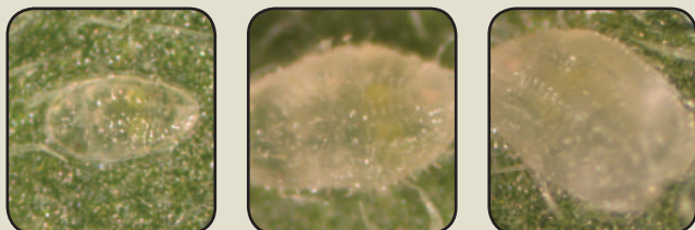
Untreated whitefly nymphs