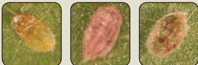
Treated whitefly nymphs