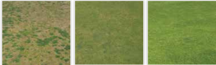
Untreated Control Quali-Pro® Chlorothalonil 720 SFT 3.6 fl oz + Signature® 4 oz Daconil Action™ 3.5 fl oz + Appear® 6 fl oz