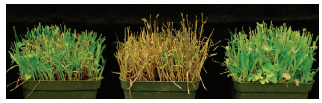
Sedgehammer® Herbicide 1.33 oz/acre