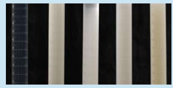
Products following initial mixing. L to R: Transport® Mikron™, Cy-Kick®, Demand®, Tempo®, Termidor®

With its groundbreaking formulation, Transport Mikron insecticide is like nothing you've ever seen before. In fact, you can't see it at all! Transport Mikron features a uniquely clear formulation, eliminating the possibility of staining or messy residue associated with other formulations. With Transport Mikron insecticide, you won't leave a mess — or pests — behind.